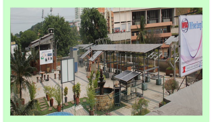
UMPEDAC Solar Garden

More detailed information of this programme are available from the Institute for Advanced Studies (formerly Institute of Graduate Studies) website at www.ias.um.edu.my